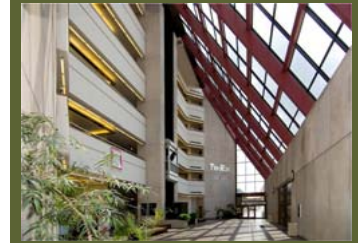
FedEx Freight Atrium