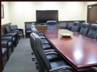
Community First Bank Partners Room