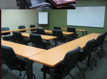
Donna S. Barber Room