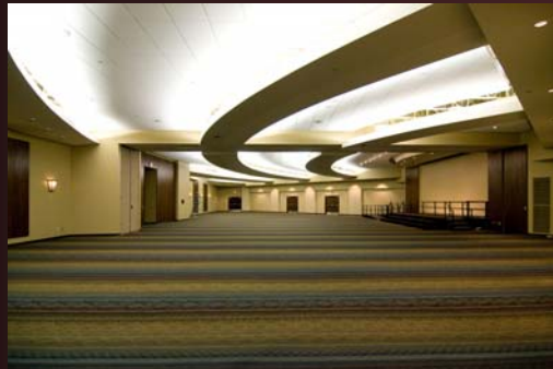
Durand Center Main Room

*Non-refundable Reservation Deposit: (Applied toward total fee) Durand Center $100 Breakout Rooms $50